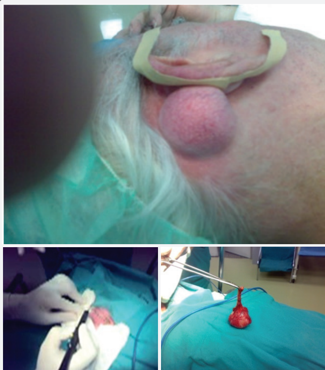
Figure 8: Skin and soft tissue incision without pressure. Extirpated retroauricle tumor. Localization for this technique is not important.

Because of blood presence in region, different surgical interventions on head and neck request use of that kind