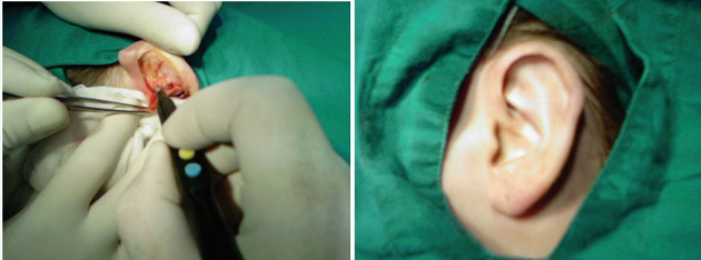
Figure 6: Bloodless operation. Radio-otoplastics active—left. Right - ear-shell sight soon after intervention (without edema and blood traces).

be excellent. It can be shaped under different angles and, thanks to that, it can afford hemostasy in hard reaching regions, especially in caverns or under the flap, when direct visibility is hard to achieve (Figures 6 & 7).